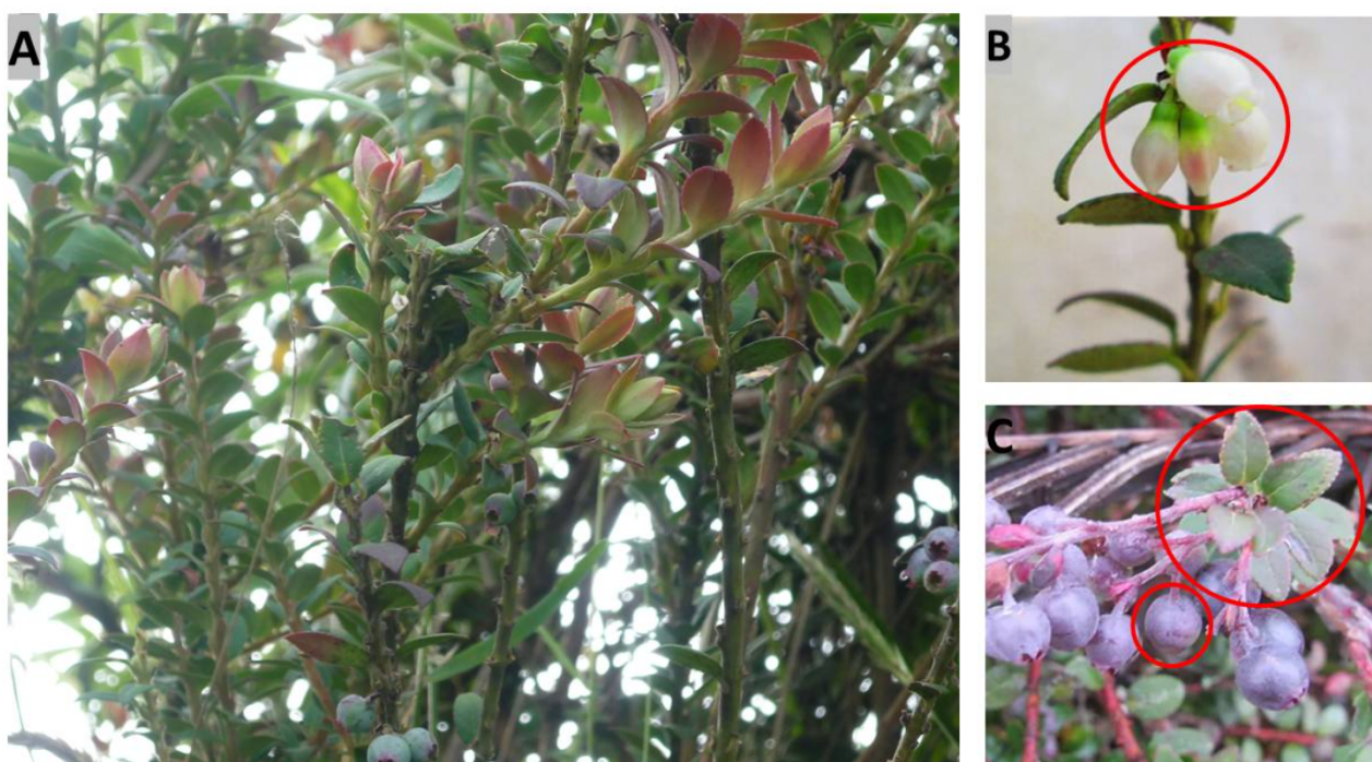
Figure 3. Mortiño plant ( Vaccinium floribundum Kunth) with its floral primordia (A), A small bunch of flowers with some pigmentation (B), Serrated leaves and its ripe berries (C).

During its development, the fruit color transitions from green to white-pink, to pink, and finally to blue-black [16]. Fruit development after anthesis takes roughly between 60 and 100 days under natural conditions [17]. Taxonomically, V. floribundum has traditionally been classified within the Pyxothamnus section in the genus Vaccinium along with V. consanguineum and V. ovatum . However, phylogenetic analysis of tribe Vaccineae suggested Vaccinium is not monophyletic with V. floribundum , forming a clade along with V. consanguineum and V. meridionale , separate from other Vaccinium spp. [17].