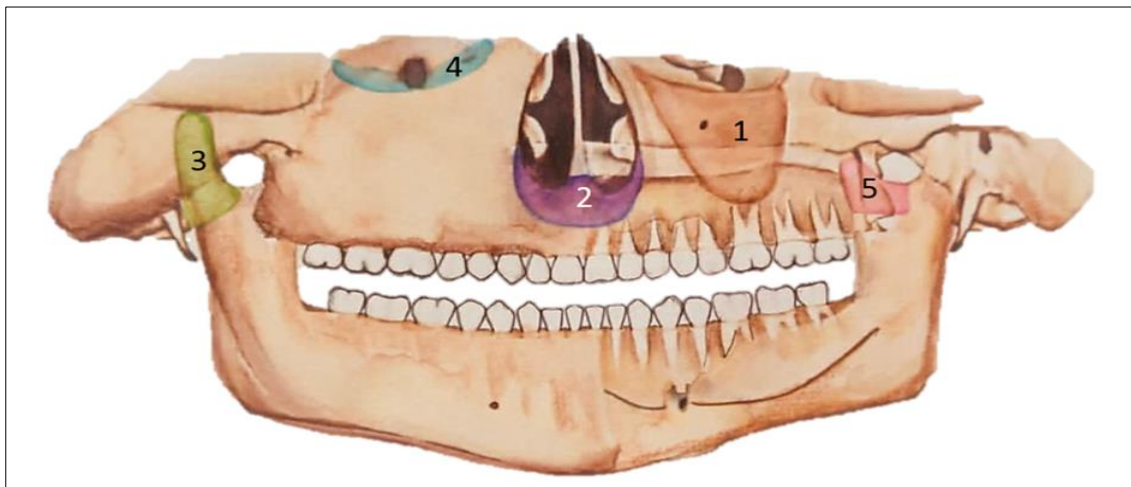
Figure 1 Prevalence of anatomical zones in which ectopic dental pieces are located: 1, maxillary sinus, 2, nasal cavity, 3, mandibular condyle, 4, infraorbital rim, 5, sigmoid notch

The anatomical position in which these dental pieces are frequently located, summarized in (Table 1) and represented in (Figure 1), show that the anatomical region of the upper ectopic dental inclusions is the maxillary sinus, followed by the nasal cavity and infraorbital rim. On the other hand, the areas of the lower jaw where ectopic teeth occur are the condylar region, subcondylar region and the sigmoid notch.