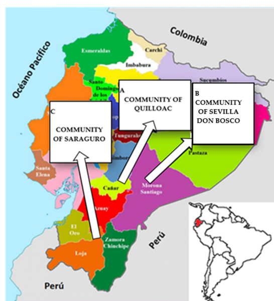
Figure 1. Map of the provinces where the participating communities are located. A: Cañar: community of Quilloac. B: Morona Santiago: community of Sevilla Don Bosco. C: Loja: Community of Saraguro.

Of the 396 women who participated in this study, 131 belonged to the Quilloac community of the Kichwa ethnic group, 145 to the Don Bosco community of the Shuar ethnic group, and 120 to the community of Saraguro of the same ethnicity. Figure 1 shows the map of the provinces of Cañar, Morona Santiago and Loja, where the communities are located.