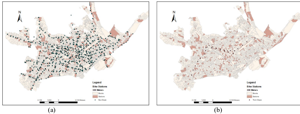
Fig. 3. (a) Location of bike stations and bus stops at 300 meters. (b) Location of bike stations and tram stops at 300 meters.

stations for a distance radius between 300 and 500 meters, respectively. These values provide coverage to the entire city applying the restrictions established in the model. Furthermore, the maps presented reveal that the stations' location covers the bus stops (see Fig. 3 (a)), and the tram stops see Fig. 3 (b), demonstrating that a BSS can be integrated with the public transport systems available in the city (i.e., buses, trams) and private cars (last mile points).