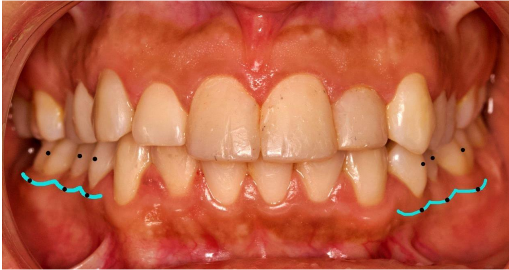
Figure 1. The WALA rim is the junction between the basal bone and the alveolar bone.