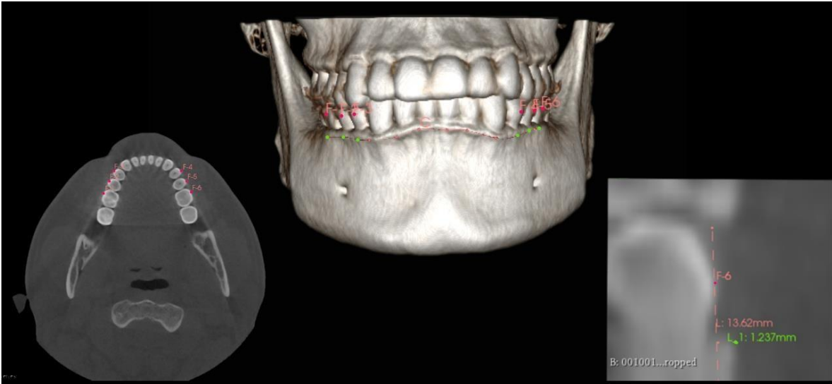
Figure 2: WALA border on CBCT, FA point pink; WALA point green.

The average of the measurements obtained in Meshmixer as well as in 3D Slicer were processed using SPSS Statistical Packages for the Social Sciences version 20 software (IBM Corp.; Armonk, NY, USA). Figure 3. The results were reflected in tables. The statistical analysis of the data was processed through the SPSS program by means of Student's t-test calculations for related samples, where 95% confidence intervals were applied. (Table 3).