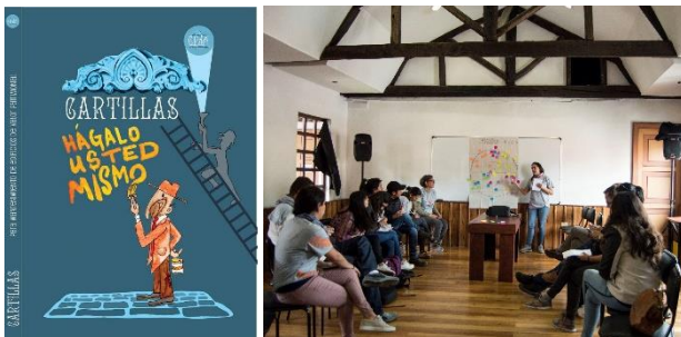
Figures 6 and 7. Left: Maintenance Primer. Right: El Vergel Campaign monitoring group, evaluation session.

In the control phase, in addition to focusing only on the monitoring of the new physical state of the intervened buildings, the UC proposal in urban campaigns was to integrate participatory evaluation activities from the beginning. This has allowed to unlink the exclusivity of this activity to the expert technicians, and give the opportunity to be the same people involved who jointly analyze the causes and consequences of what is being done. Self-reflection exercises with socio-dramas and Dianas along with the incipient conformation of a mixed monitoring team, opened a possible path so that everyone could contribute their vision of the process. This could enhance the use of the manuals by the beneficiary families, since there would be a previous accompaniment work in the evaluation whose responsibility does not only fall on them.