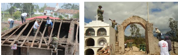
Figures 1 and 2. Susudel maintenance campaigns. Left Possesiones Street. Right Cemetery.

In 2011, recognizing the high obsolescence degree of the old vernacular buildings, the available knowledge about traditional construction systems and the high level of community organization of its inhabitants, CPM decided to promote the first maintenance campaign, in approximately 48 buildings of Las Posesiones street, in collaboration with local institutions and community members. And later, in 2013 the same model of joint work for the conservation of the Susudel heritage cemetery was implemented (Cardoso et al., 2017).