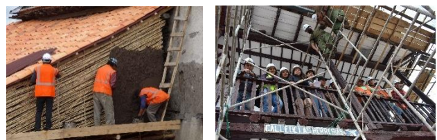
Figures 3 and 4. Maintenance campaigns in Cuenca. Left San Roque. Right El Vergel neighbourhood at Las neighborhood Herrerías Street.

In addition, the physical characteristics of the heritage buildings were similar to those of the Susudel heritage buildings, that is, modest examples of vernacular earthen architecture with an advanced state of deterioration. In this case, meetings were also promoted with the community, to present the studies and explain the criteria for the selection of buildings, such as the heritage value of the property, its state of conservation and the owners availability to participate in the process. In Las Herrerías, the criteria of the socioeconomic condition of the owners was added to guarantee support to the most vulnerable groups. In addition, great efforts were made to involve public institutions and other public and private organizations in the process.