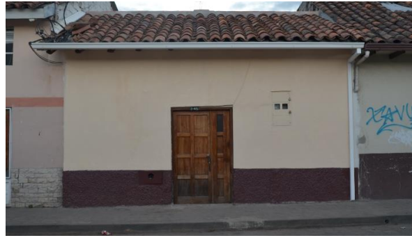
Figure 6. After the Herrerías Maintenance Campaign