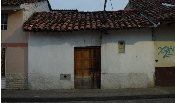
Figure 4. Before the Herrerías Maintenance Campaign